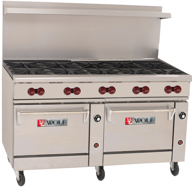
Model C60-SS-10B-N (Shown with optional casters)