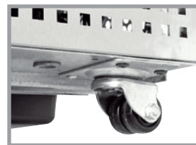
1 1/2" diameter dual swivel castors for "LP" models.