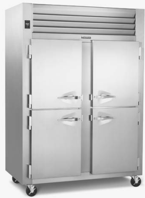
Model RHT232WUT-HHS (shown with optional casters)