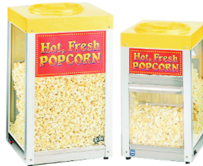
15NCPW 12NCPW Popcorn Merchandiser/Warmer