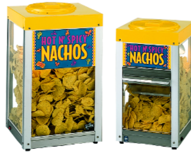
15NCPW 12NCPW Nacho Chip Merchandiser/Warmer

Star's Merchandiser Warmers are covered by a one-year parts and labor warranty.