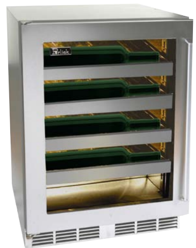
HD24WS (glass door)