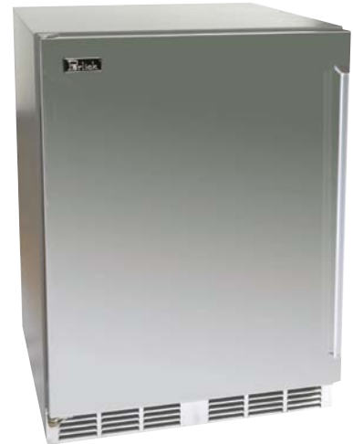
HD24RS (solid door)