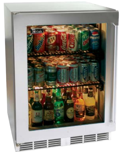
HD24RS (glass door)