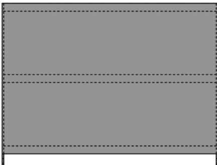
Solid Brute Shelf – 700# Wt. Capacity