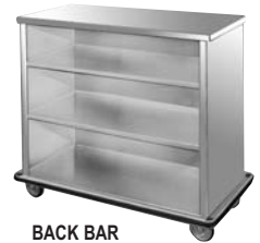
BACK BAR SPSC-44

Holds 200 lbs. of ice! Fully insulated. Flip-top stainless lid. Drain, push bar handle, and all swivel 5" casters. Welded steel frame.