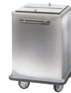
ICE STORAGE CART SIC-222

Holds 200 lbs. of ice! Fully insulated. Flip-top stainless lid. Drain, push bar handle, and all swivel 5" casters. Welded steel frame.