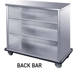
BACK BAR SPSC-44

Holds 200 lbs. of ice! Fully insulated. Flip-top stainless lid. Drain, push bar handle, and all swivel 5" casters. Welded steel frame.