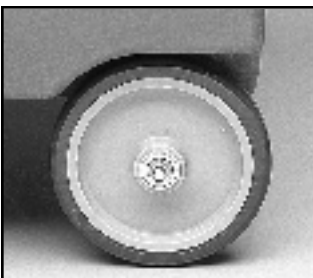
10" (25,4 cm) Easy Wheels on ICS175LB Models.