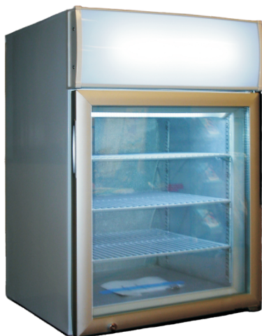
Model SCTF-4 Lightbar on top for branding