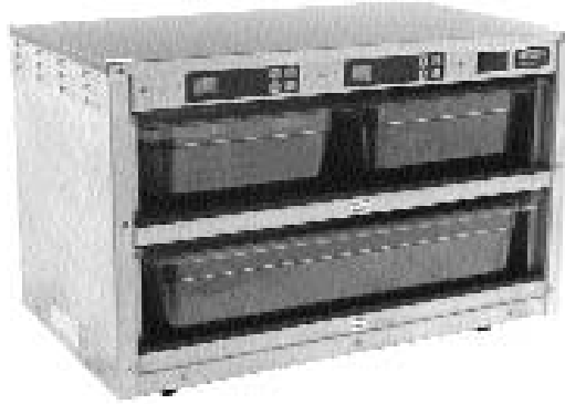
MC212S for 4" deep pans Shown with one full size and two half-size pans (not included)

Since 1947, Foodservice Equipment That Delivers!