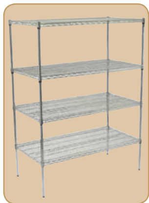
Customize WINCO's Chrome Plated Wire Shelves to accommodate all your storage needs