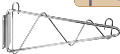
VC-SERIES WALL MOUNT BRACKET