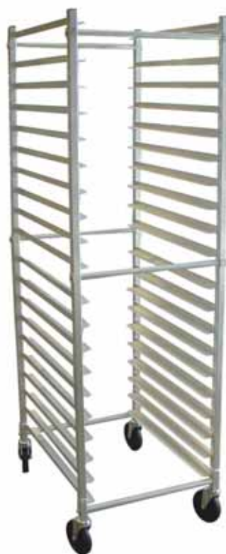
Pan Rack Tray Direction Guide