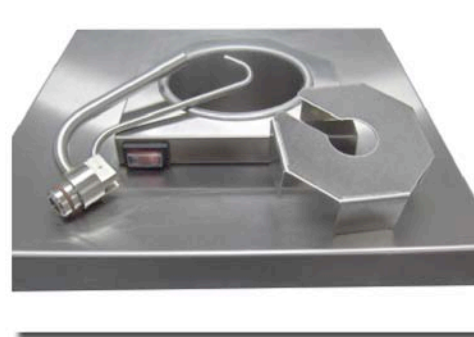
Quick & Easy Drain Lever

Limited two year parts & one year labor *Patent Pending*