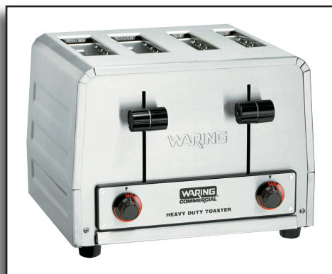
WCT810/WCT815/WCT815B Combination Toasters