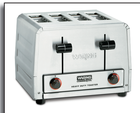
WCT820 Bagel Toaster