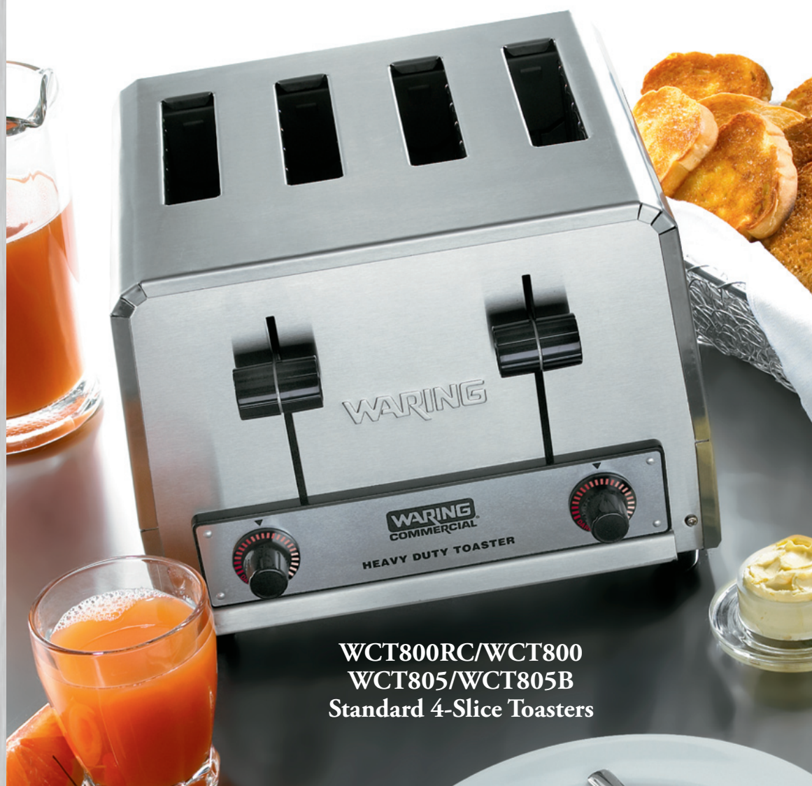
WCT800RC/WCT800 WCT805/WCT805B Standard 4-Slice Toasters