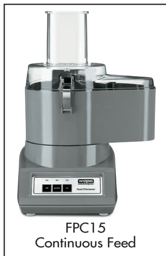
FPC15 Continuous Feed