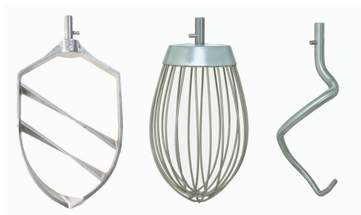
Standard tools: Stainless Steel flat beater, wire whip, and dough hook.

5489 Campus Drive Shreveport, LA 71129 USA