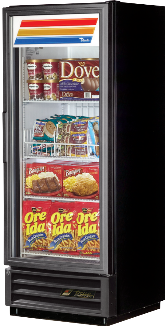
Shown with optional black exterior.