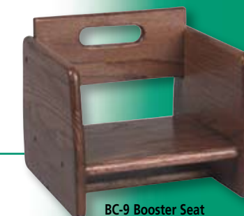
BC-9 Booster Seat