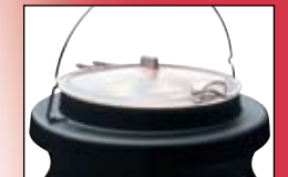
Optional transport collar makes for easy transporting of full food insert from kettle to storage.