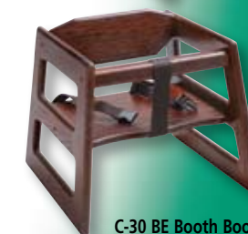
C-30 BE Booth Booster Seat