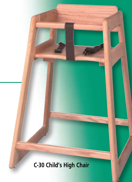
C-30 Child's High Chair