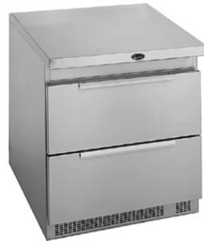
model 9404-32D-7 shown

REFRIGERATION: CFC free, R-134a (refrigerators), R-404a (freezer) back-mounted refrigeration system to be self-contained with evaporator blower coil, compressor, thermostatic control, forced-air condensing coil and capillary tube contained in removable assembly. Condensate evaporator provided. Units totally prewired and to be supplied with 8' cordset (NEMA 5-15P) for 115V operation. "Front Breathing" refrigeration system, requires no side or back clearance. Integrated rubber bumpers provide 1" rear clearance on model 9301F-7.