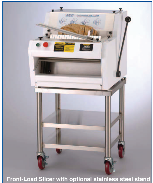
Front-Load Slicer with optional stainless steel stand