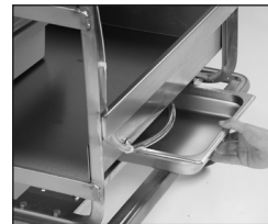
Drain Pan Holder