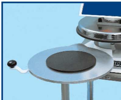
DP1100M Shown with LPMI10