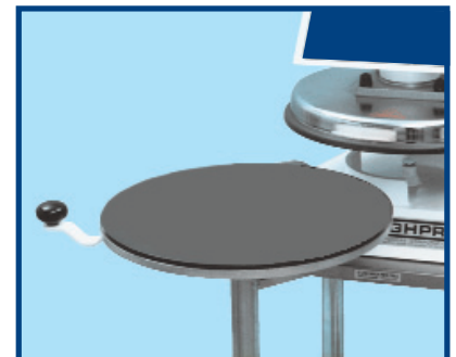
DP1100M Shown with LPMI180

Specifications, Details and Prices are subject to change without prior notice. Please call for current pricing.