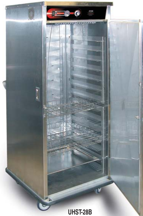
UHST-28B with fixed spacings