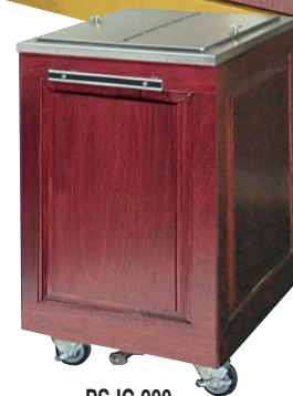
PS-IC-200 Ice Storage Cart