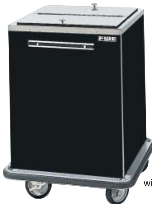
IC-222 with Black Laminate