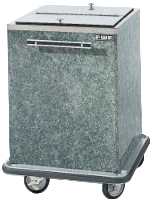
IC-222 with Custom Laminate