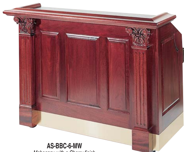
AS-BBC-6-MW Mahogany with a Cherry finish

Exterior with Stainless Steel Working Side