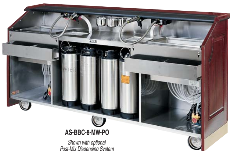
AS-BBC-8-MW-PO Shown with optional Post-Mix Dispensing System

Specify Dispensing System Sink and Fittings at time of order: