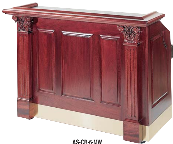
AS-CB-6-MW Mahogany with a Cherry finish

Exterior with Stainless Steel Working Side