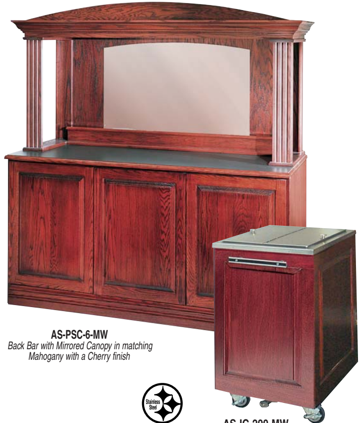
AS-PSC-6-MW Back Bar with Mirrored Canopy in matching Mahogany with a Cherry finish