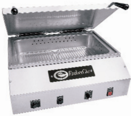
ES10 Food Steamer Model ES10T