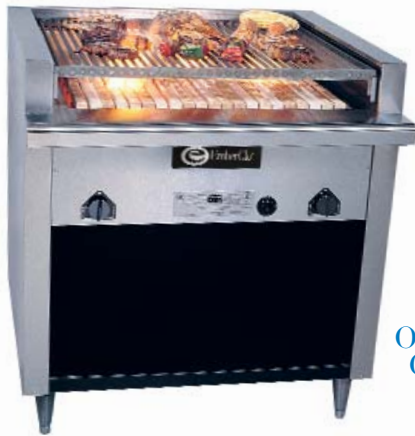
Open Hearth Closed Front Gas Broiler - Floor Model 41F

EmberGlo’s eye-catching glowing hearth will reach a temperature of 1800° searing your meats yet preserving their natural flavor. Only EmberGlo® Gas Char Broilers feature the special inshot gas burners that supply broiling heat to a durable, completely ceramic hearth. The Barbriq® transmit searing radiant heat to the meat utilizing its natural juices and creating more natural fuel. Burner jets are located along the sides, in the recessed hearth, instead of below it. This design prevents the jets from becoming clogged with dripping grease or food particles, cleaning the burner unit with exceptional temperature control. Open Hearth Gas Broilers feature EmberGlo’s exclusive Flaretrol® system—the most effective means of flame control for open hearth broiling. When grease starts to flare up, simply flip the Flaretrol® switch and a steady stream of air brings the flames under control. EmberGlo’s Open Hearth Broilers give that great outdoor flavor with indoor convenience.