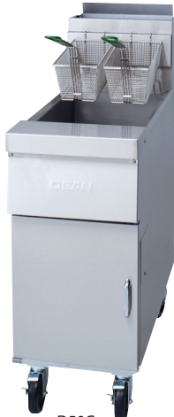
D50G Shown with optional casters.

*Matching cabinet required for optional filtration.