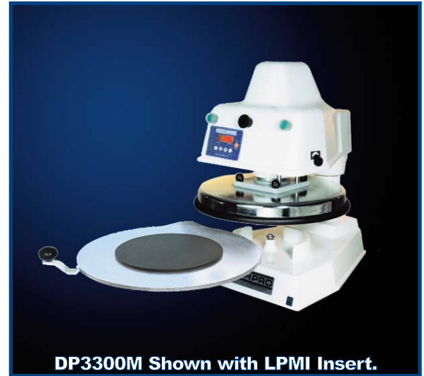
DP3300M Shown with LPMI Insert.

Please see various LPMI molds in Accessories. (Lower Platen Mold Insert)