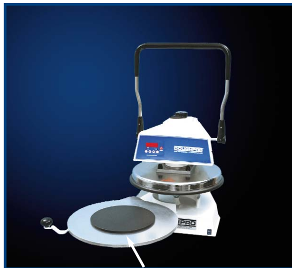
DP1100M Shown with LPMI Insert.

Please see various LPMI molds in Accessories. (Lower Platen Mold Insert)