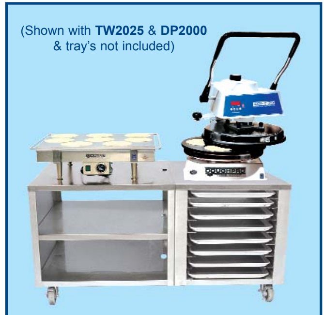
(Shown with TW2025 & DP2000 & tray's not included)

Step 3: Place the flattened tortillas on either our model TW2025 or TW1520 grill. The tortillas will finish in a matter of minutes and then they can be served hot FRESH off the grill.