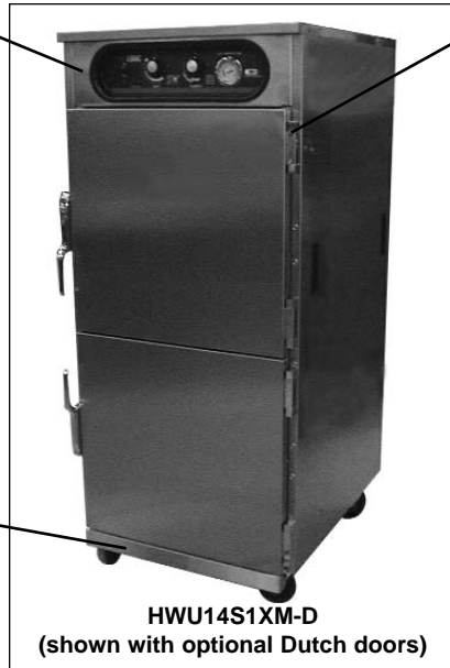
HWU14S1XM-D (shown with optional Dutch doors)

STAINLESS STEEL DRIP TROUGH... Located at base of door to catch condensation. Easy to remove sliding keyhole design for emptying and cleaning.