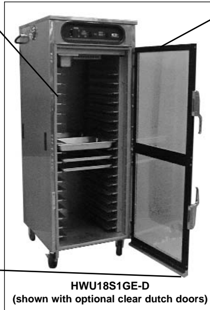
HWU18S1GE-D (shown with optional clear dutch doors)

STAINLESS STEEL DRIP TROUGH... Located at base of door to catch condensation. Easy to remove sliding keyhole design for emptying and cleaning.