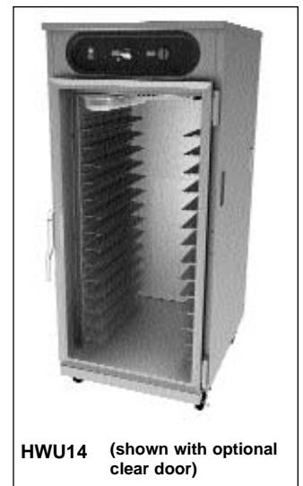
HWU14 (shown with optional clear door)