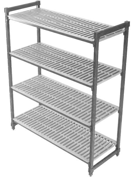
Four Shelf Unit with Vented Shelf Plates.