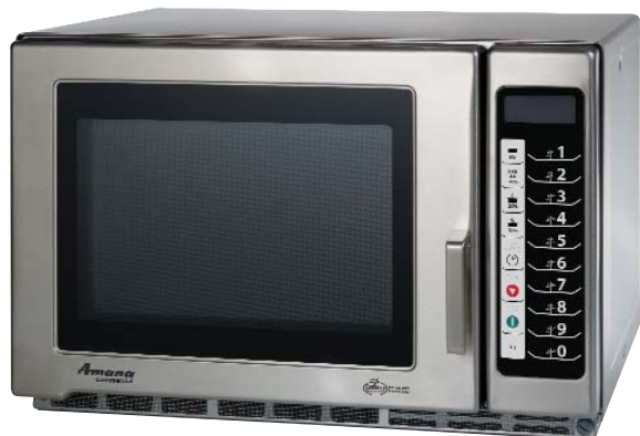
Model RFS12TS shown