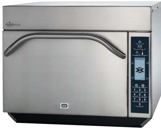
Model AXP22 shown