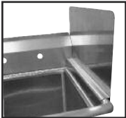
K-700 Removable Side Splashes Fits Left OR Right Side