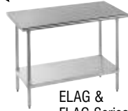
ELAG & FLAG Series Flat Top

Plastic Bullet Feet standard on ELAG, FLAG & KLAG Series