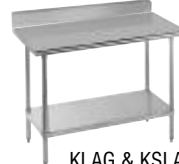
KLAG & KSLAG Series 5" Backsplash