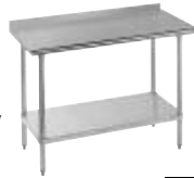
MSLAG, SLAG & SFLAG Series 1 1/2" Backsplash