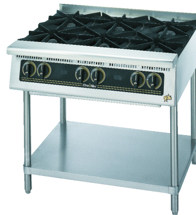
Model 806H Shown with Optional Floor Stand